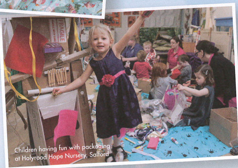
Children having fun with packaging at Holyrood Hope Nursery, Salford

"This all fits in with the Government's British Values guidelines for nurseries on celebrating different faiths and cultures."